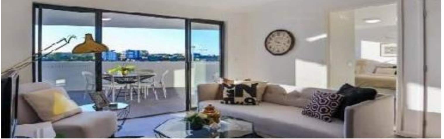
Unit 802, 41 Thomas St, Chermerside